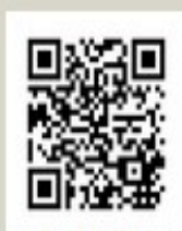
LC4X4DS2 QR Code Link to Web Page